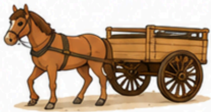
Horse and cart